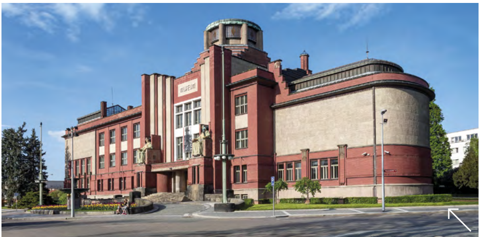
Museum of Eastern Bohemia in Hradec Králové