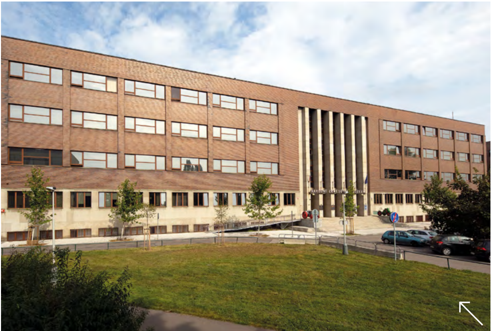
National Museum of Agriculture